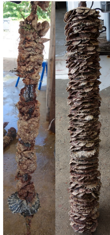
Fig. 1. Shade-mesh (left) and Plates (right) collectors after 16 months of immersion.

Results for Pinctada maculata spat density showed a higher